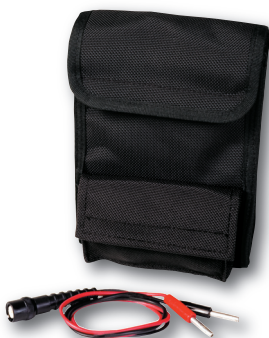
Complete with tool-belt holster and test leads